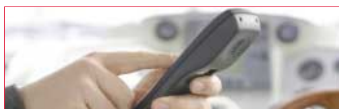
Analogue global voice