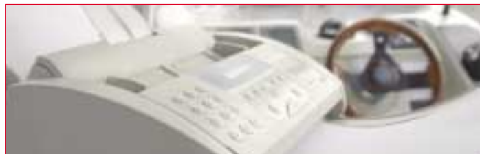
Group 3 and Group 4 fax